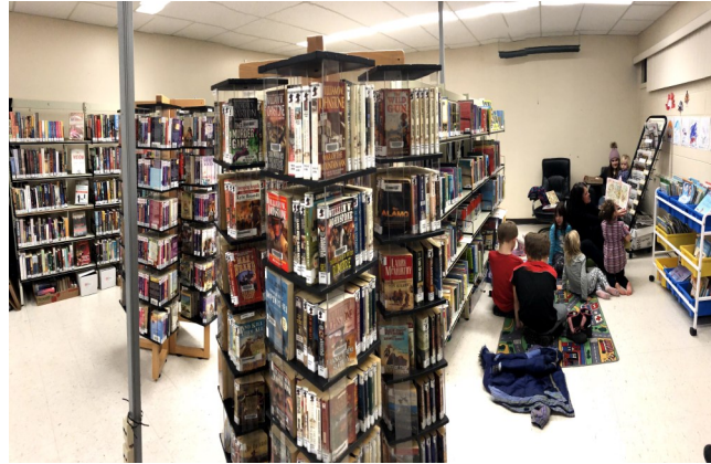
The Library operated out of Mapleridge Public School during the renovations. Thank you to the Near North School Board and Mapleridge Public School for sharing their space with us.