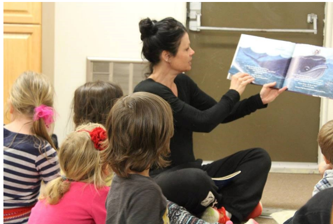
A few programs, such as our children's Raising Readers Program, ran the whole school year without any interruptions,