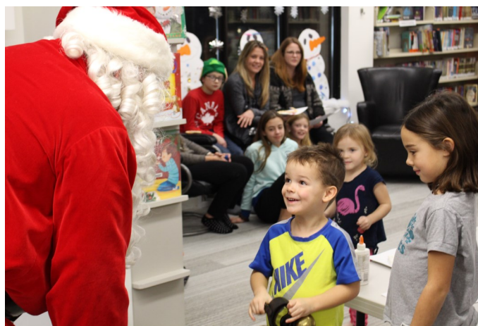
Santa is visiting our Raising Readers Program to the delight of children and on-looking parents,