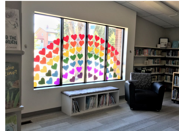
At the end of April, the library is still closed to the public. A rainbow of hearts display to show solidarity and encouragement to the community.